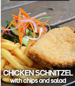
CHICKEN SCHNITZEL with chips and salad