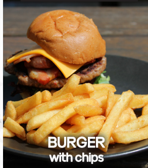
BURGER with chips