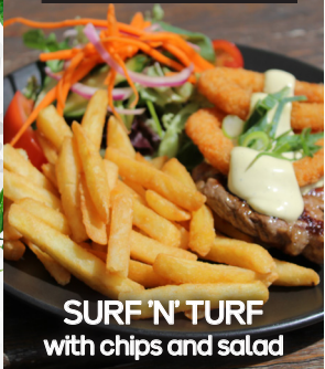
SURF 'N' TURF with chips and salad